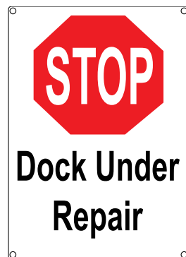
10 x 14 sign backing shown