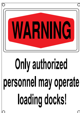
10" x 14" sign backing shown