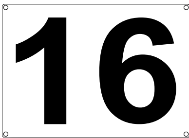
10" x 14" sign backing shown