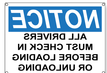
10" x 14" sign backing shown