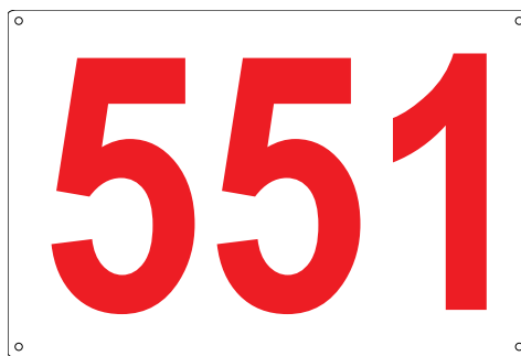
24" x 16" sign backing shown