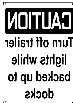
10" x 14" sign backing shown